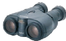
Image Stabilized Canon Binoculars

The classic handbook on rips, curls and chillin' after. When and where to find the best breaks-how to get there and where to stay. ISBN 0967910005